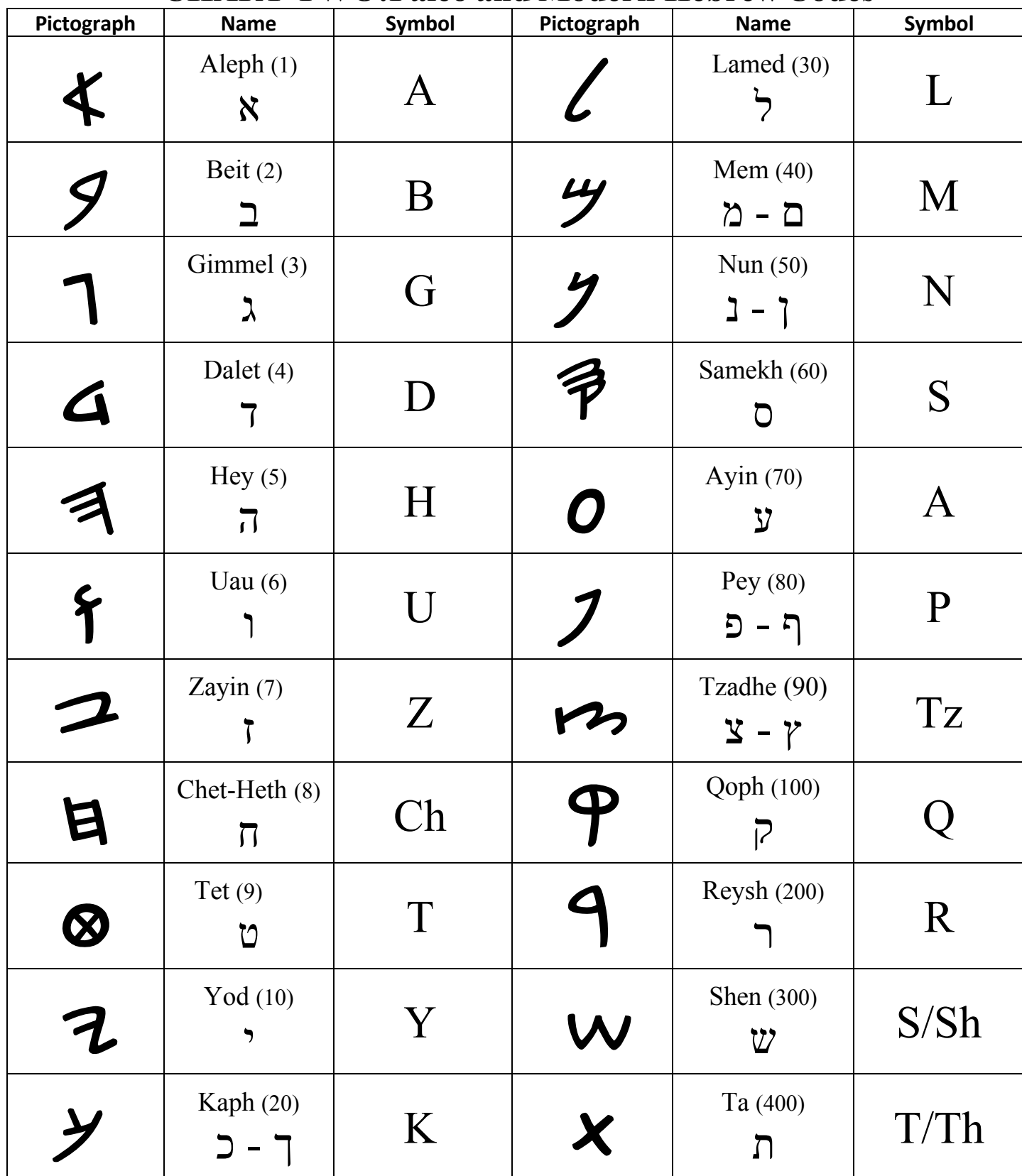
CHART TWO: Paleo and Modern Hebrew Codes